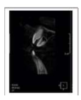
Figure 4: Axial View - showing Left Central incisor and palatal odontome.

After assessment of CBCT and consultations with orthodontic department team, it was concluded that both odontomes would be surgically excised to allow both permanent central incisors to erupt. Follow up period was set for 18 months, after which orthodontic traction would be done if both failed to erupt. The surgical procedure included an infiltration of 4% Articaine both buccally and palataly, crestal incision from the canine to the canine of the opposite side [Figure 5] with the subsequent reflection of a palatal flap [Figure 6]. No buccal flap was raised to preserve the integrity of the follicles of both impacted central incisors.