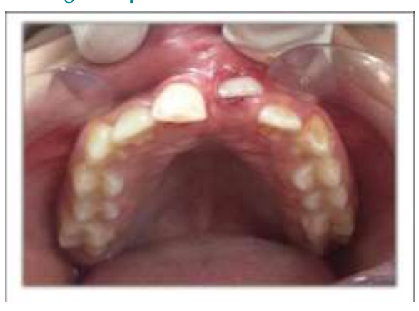
Figure 17: Intraoral Occlusal View showing surgical exposure of Left central Incisor.

Both central incisors were erupted by the 24 months postoperative and no recurrence was observed. Patient confirmed their eruption but failed to show up for further follow up.