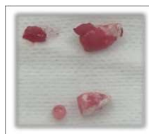
Figure 10: Surgical excised Odontomes