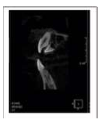
Figure 3: Axial View - showing Right Central incisor and palatal odontome.