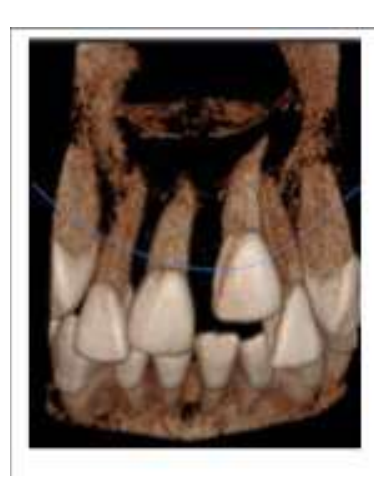
Figure 13: 3D reconstruction CBCT showing significant eruption of both central incisors after 12 months postoperatively.

After 18 months postoperative the left central incisor failed to erupt as seen in intraoral frontal and occlusal photographs [Figure 14-15] and therefore after consultation with orthodontic department team surgical exposure was done [Figure 16-17].