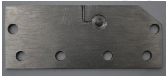
Figure 2: The artificial canal.