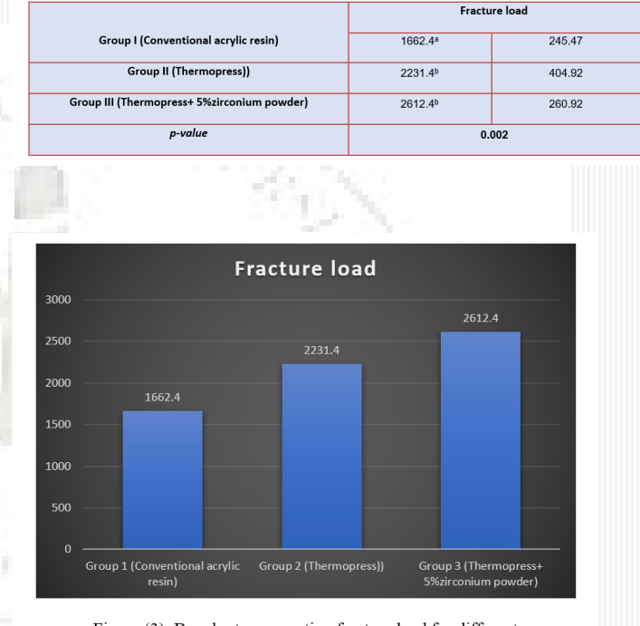
Figure (3): Bar chart representing fracture load for different groups

difference was found between (Group2) and (Group3) where (p=0.173). The highest mean value was found in (Group3) followed by (Group2), while the least mean value was found in (Group1).