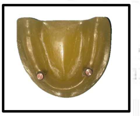
Fig 1 Epoxy resin model

In order to standardize the dimensions of the constructed overdentures, three indices were created in the base of the epoxy model to facilitate the attachment of the putty index later then it is duplicated 15 times in dental stone. These duplicate models were used to fabricate 5 identical dentures. A double layer of pink base plate wax was adapted on one of the casts then artificial teeth were set and waxed up. To ensure that the dimensions of all the dentures are identical, a rubber base index was made for the polished surface and the teeth, this ensured that the duplication of the remaining four dentures with the same denture base thickness and teeth setup.