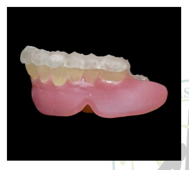
Fig. 1: Teeth positioning guide with the teeth placed over the denture base.

bases were then inserted in a post curing unit (Post curing unit, Mogassam, Egypt) for 20 minutes for further polymerization.