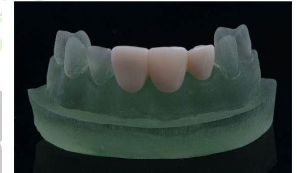
Fig 2: Labial view of VRFDP