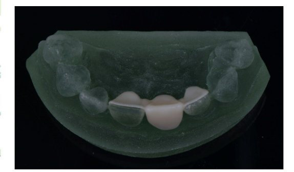
Fig 3: Palatal view of RBFDP