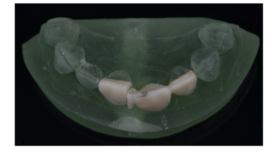
Fig 4: Fractured VRFDP at the connector

Load cycles required for veneer-retained fixed dental prosthesis to fail ( 520.16\pm117.07 ) was greater than that required to fail resin-bonded fixed dental prosthesis ( 449.19\pm163.97 ). Although the difference was not statistically significant. All bridges failed by joint fracture. (Fig. 4 & 5)