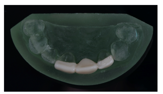
Fig 1: Palatal view of VRFDP

Excess cement was removed by a sickle scaler after initial polymerization. (Fig 1 to 3)