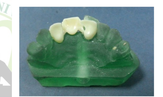
Fig 5: Fractured RBFDP at the connector