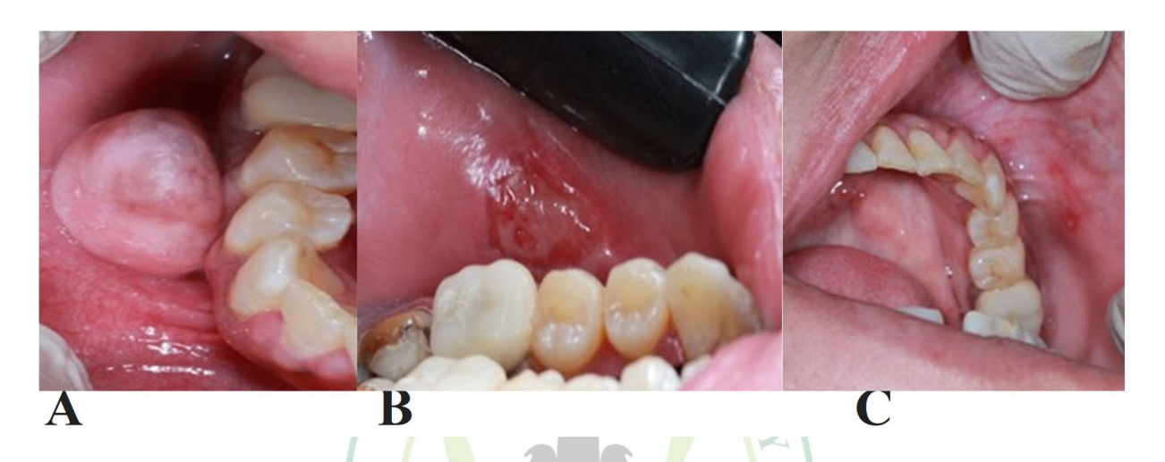
Figure 1: Intra-oral examination revealed a swelling on the right buccal mucosa (a) post-operative picture after the local excision of the spindle cell lipoma. (b) Clinical picture showing the healing process 3 weeks after the excisional biopsy (c)