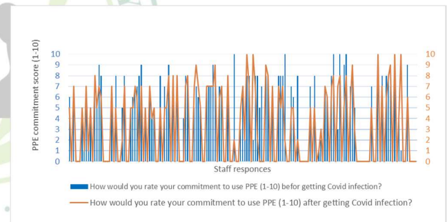
Figure 1: Differences in staff commitment to PPE measures before and after getting infected with COVID, on a scale (1-10). It is noticed that the blue stacked bars (PPE scoring before COVID) have higher trends (mean rank of 30.13) compared to the orange stacked line (PPE scoring after COVID) (mean rank of 29.57); this was significant statistically (Wilcoxon signed ranks test P value was found to be 0.000 \leq 0.010 , Z = -3.593 )

A Wilcoxon signed ranks test indicated that staff commitment to PPE measures before receiving anti COVID vaccine was rated higher than commitment after receiving the vaccine (mean ranks were found to be 17.77, 12.70 respectively), Z = -3.977 ; and P was found to be 0.001 \leq 0.010 that is of a high significance. Figure 2 shows differences in staff commitment to PPE measures before and after receiving anti COVID vaccine.